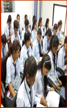
Industrial visit to I-mediata pvt. Ltd. pune