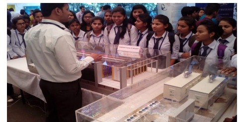
Industrial visit to C-Dac, Pune