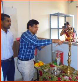
Opening ceremony of Three days Workshop on Website Development

Computer Dept has organized the three days of workshop on Web development and Industrial training by Virtue Infotech Pvt. Ltd. Pune .