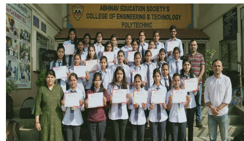
3-Day Workshop on Android Program-

technical training on the concepts and programming methodologies needed to develop applications for mobile devices. Participants will learn to use different android libraries. Instruction is aided with live projects which will allow students to grasp concepts of the complete mobile application development life-cycle.